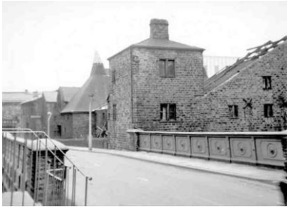
30. Where is this?