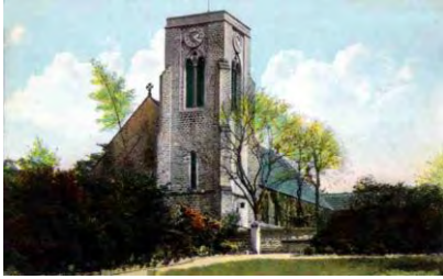
21. Where is this?