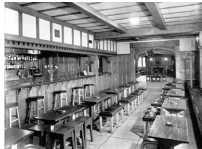
28. Where is this?