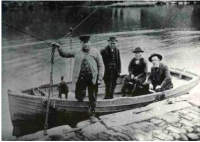
22. Where is this?