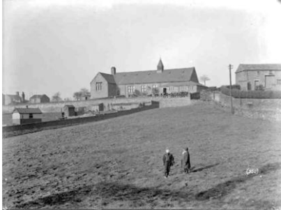
29. Where is this?