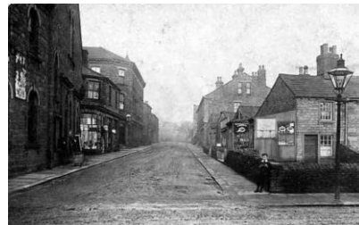
27. Where is this?