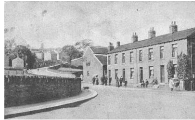
26. Where is this?