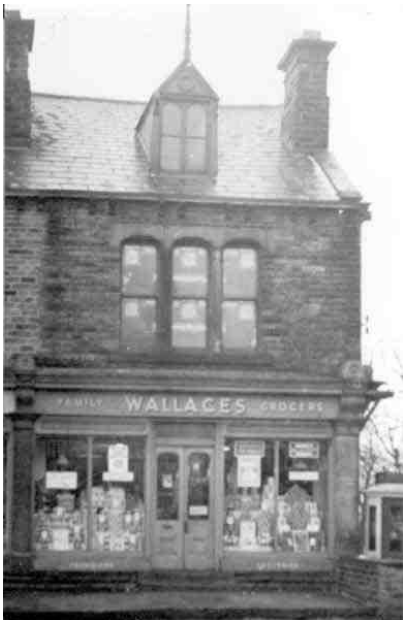
31. Where is this?