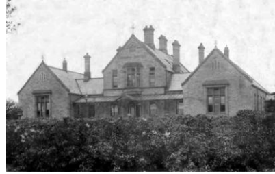
32. Where is this?