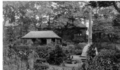
34. Where is this?