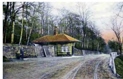
35. Where is this?

36. In what year did a "disastrous" fire destroy the old wing of the Grammar School? (Now Castle Hall)