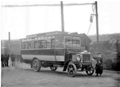
23. Where is this?