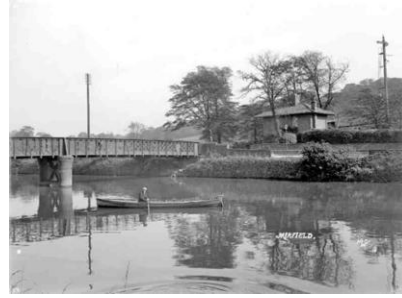
25. Where is this?