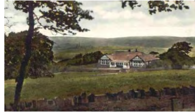
33. Where is this?