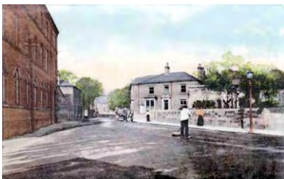
24. Where is this?